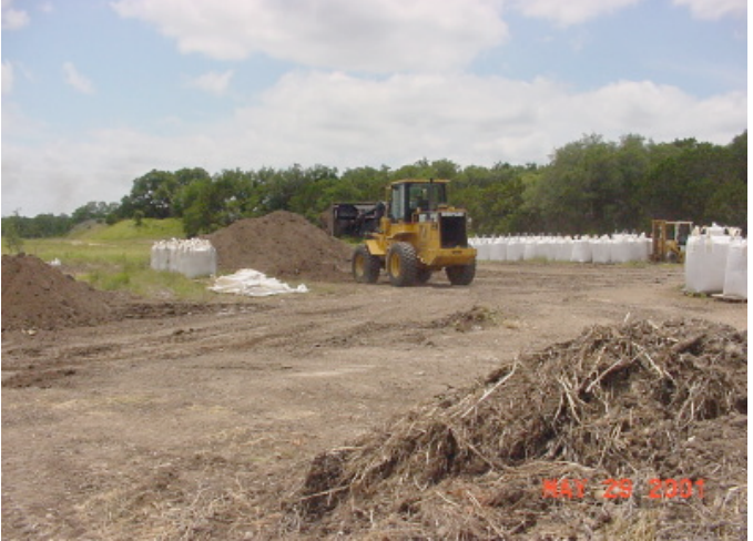
FIGURE 1. Soil mixing of Apatite II into Pbcontaminated soil at CSSA SWMU B-20.

by removing all surface debris and vegetation from the treatment site where the treated soils would be spread out. The Apatite II was delivered to the site in one-hundred and thirty-five 1,650-lb supersacks (100 metric tonnes). The soil piles were roughly mixed with 80 metric tonnes of the Apatite II by the front-end loader in an approximate ratio of 3% Apatite II by weight (Figure 1). The mixed soil was spread out over the prepared oneacre site, covered with a six inch layer of clean soil, and the site was seeded with wildflowers and